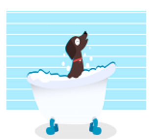
Take a relaxing bath