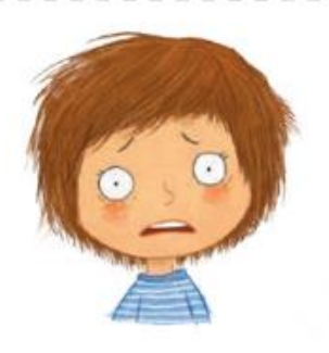
SCARED frightened, terrified, fearful