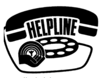
Call a helpline