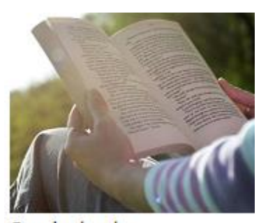
Read a book