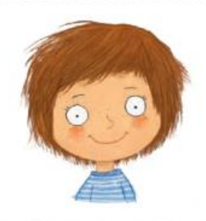
HAPPY loved, joyful, safe, cheerful, hopeful