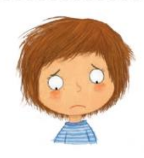
SAD unhappy, disappointed, miserable, hopeless, gloomy