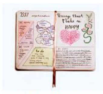
Journaling - Writing down your thoughts and feelings