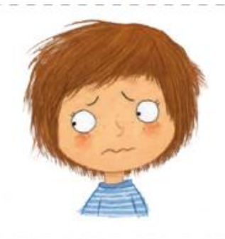
WORRIED anxious, overwhelmed, uncomfortable, unsafe, fearful