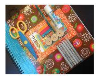
Look through old pictures, memories and create a scrapbook