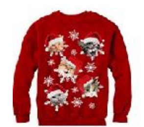
Wear your favourite outfit, even if it's silly