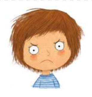
ANGRY annoyed, frustrated, cross, outraged, hurt, mad