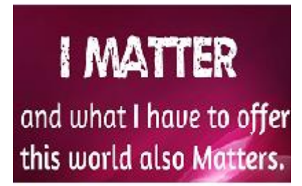
Repeat positive quotes