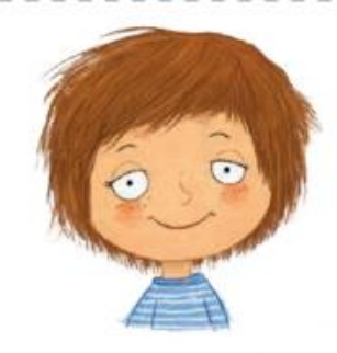
CALM quiet, relaxed, peaceful, serene