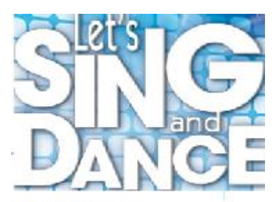
Sing or dance