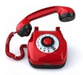
Talk to someone on the telephone