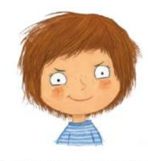
BRAVE courageous, fearless, empowered, strong, daring, independent