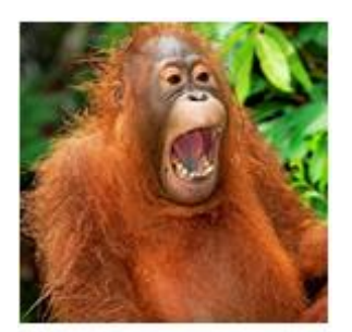
Do something that makes you laugh