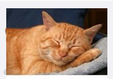
Rest well and get plenty of sleep